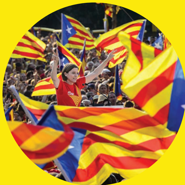
Roser Vilallonga 11/09/2014, Barcelona, Carme Forcadell

And also in Pèzilla "A people, a country, a struggle" 39 pictures by Roser Vilallonga from September 1 to 28, 2018